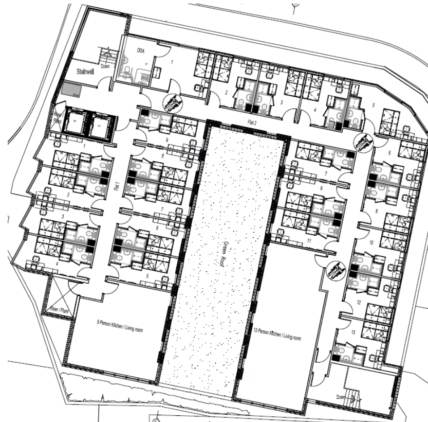
Fourth Floor Layout