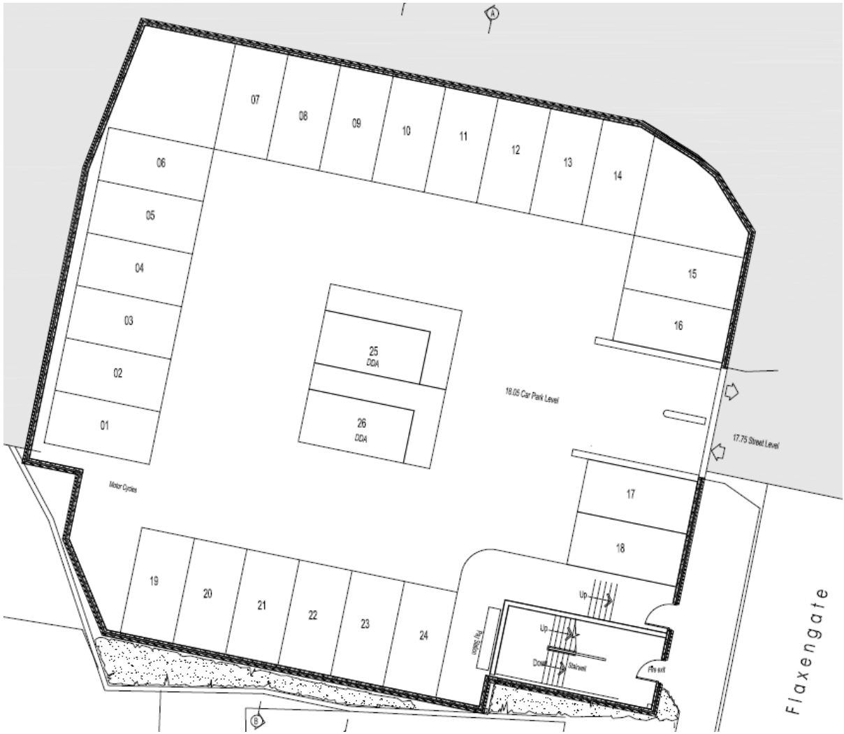
Car Park Plan (Lower Ground Floor)