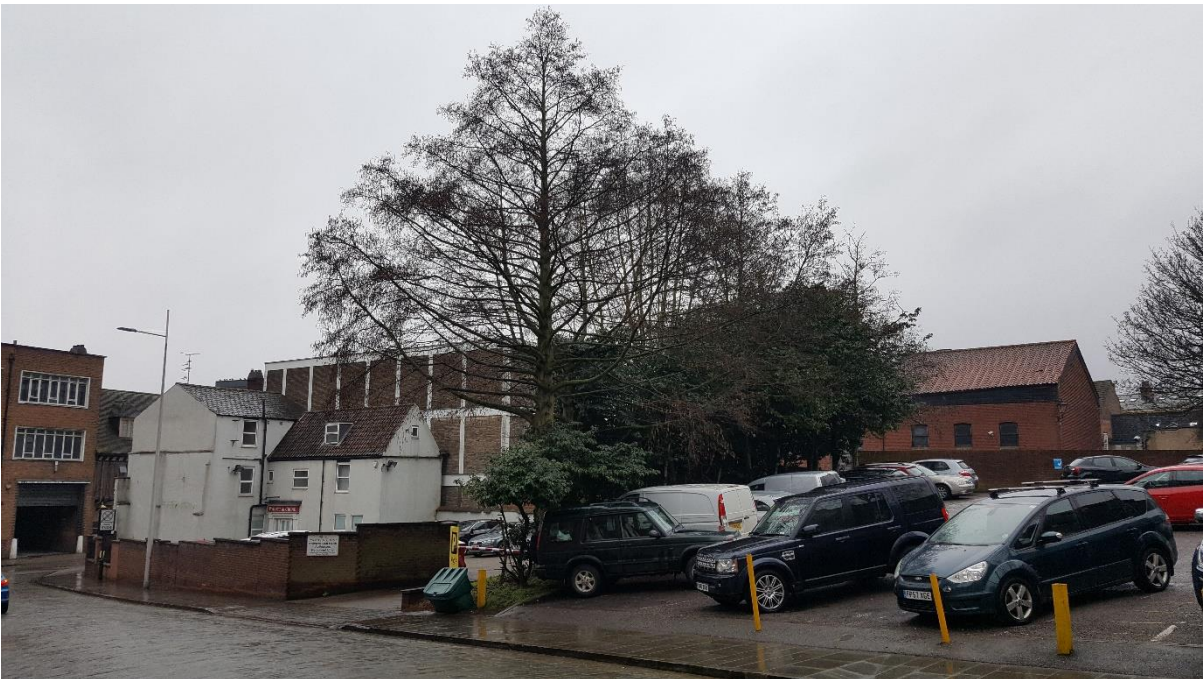
View from Flaxengate across the site towards its southern boundary