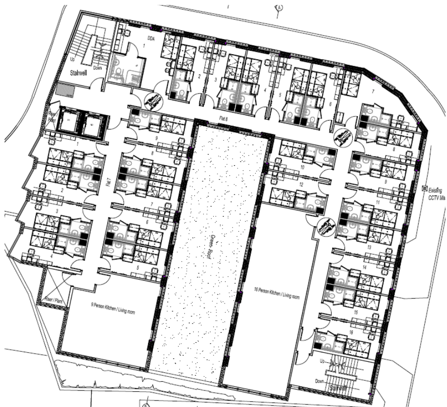
First, Second and Third Floor Layout