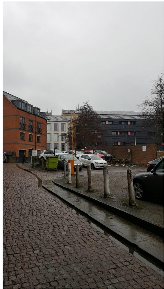
Views north along Flaxengate and Swan Street Respectively