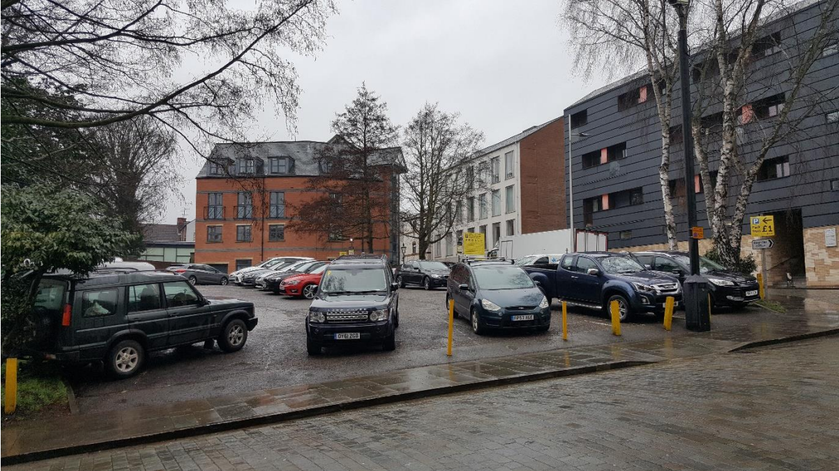
View from Flaxengate across the site towards Grantham Street & Swan Street