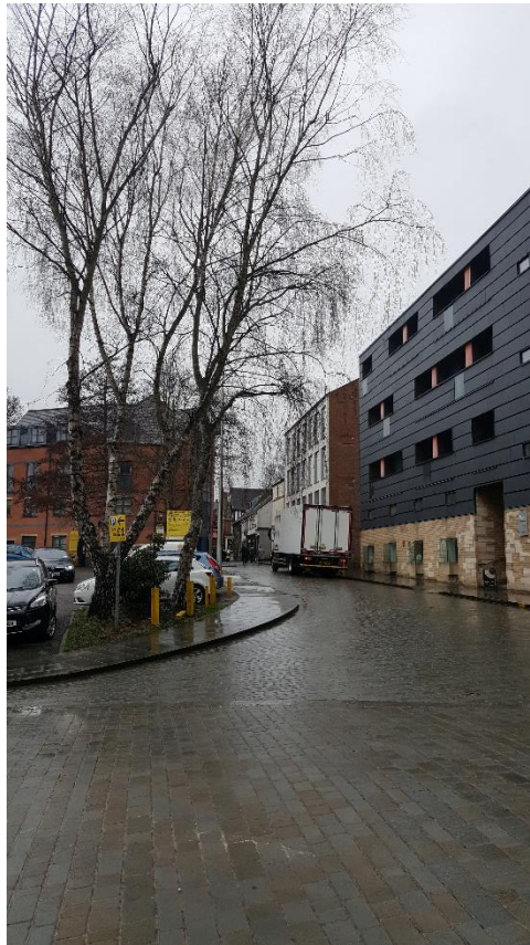
Views in either direction along Grantham Street