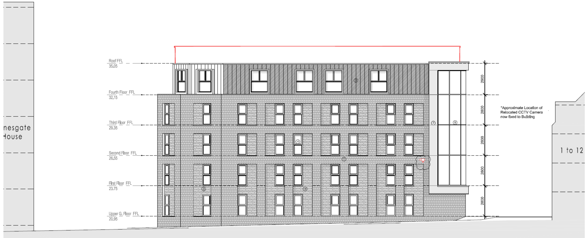
Proposed North Elevation