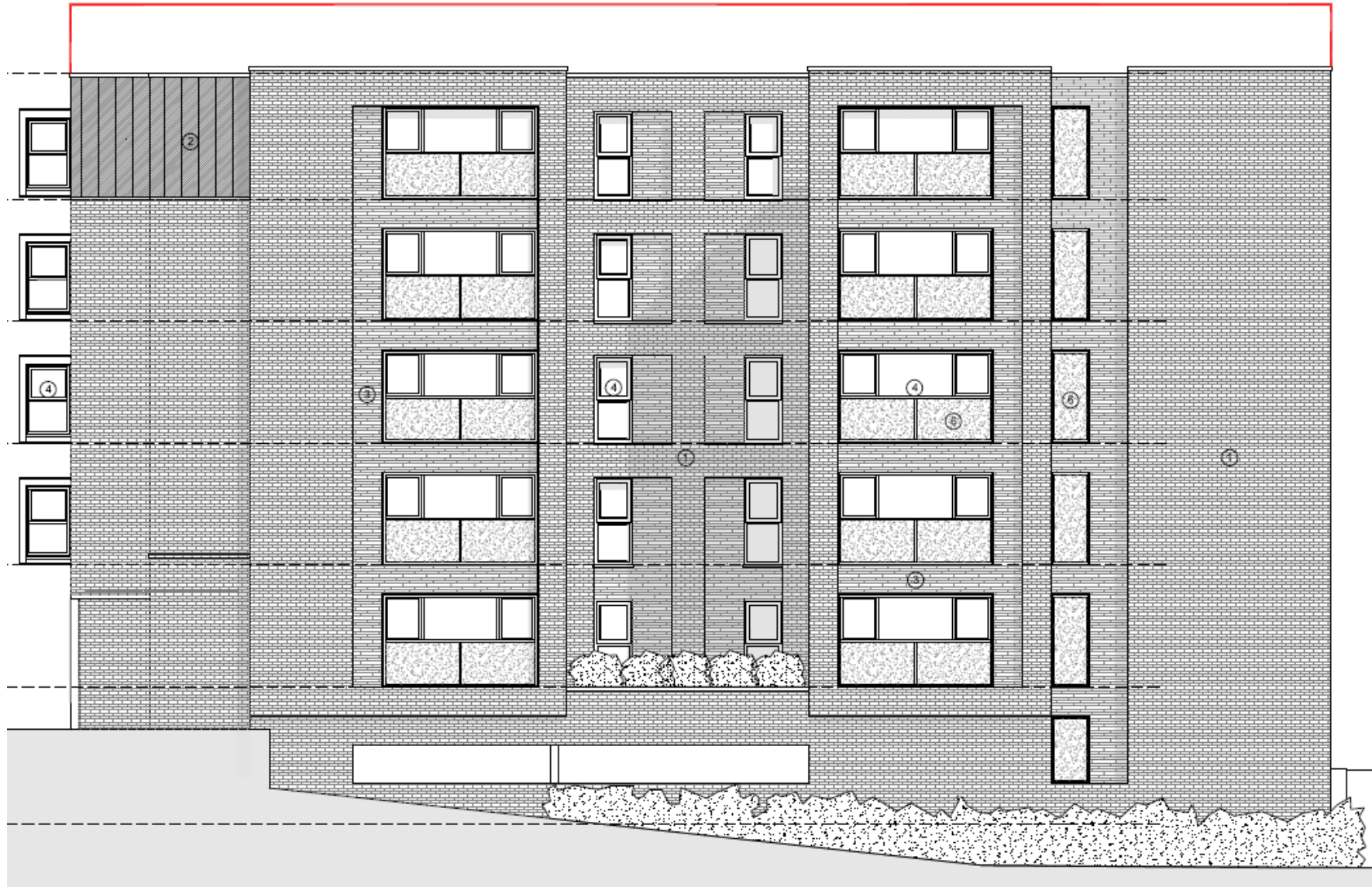
Proposed South Elevation